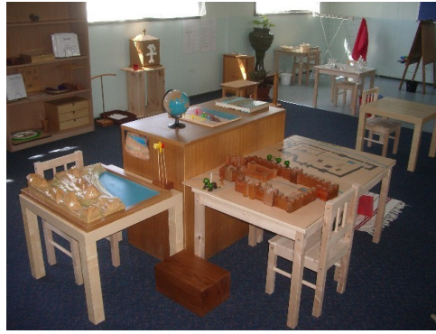
City of Jerusalem and Geography